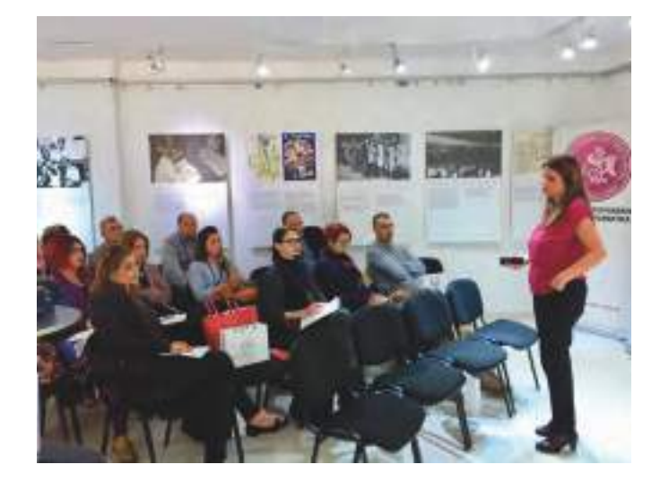
Lectures at the regional seminar in Belgrade

The participants of the seminar visited the renovated building of the National Museum in Belgrade, reopens to visitors after 15 years, and unanimously concluded that it is necessary to organize similar educational seminars in the following period.