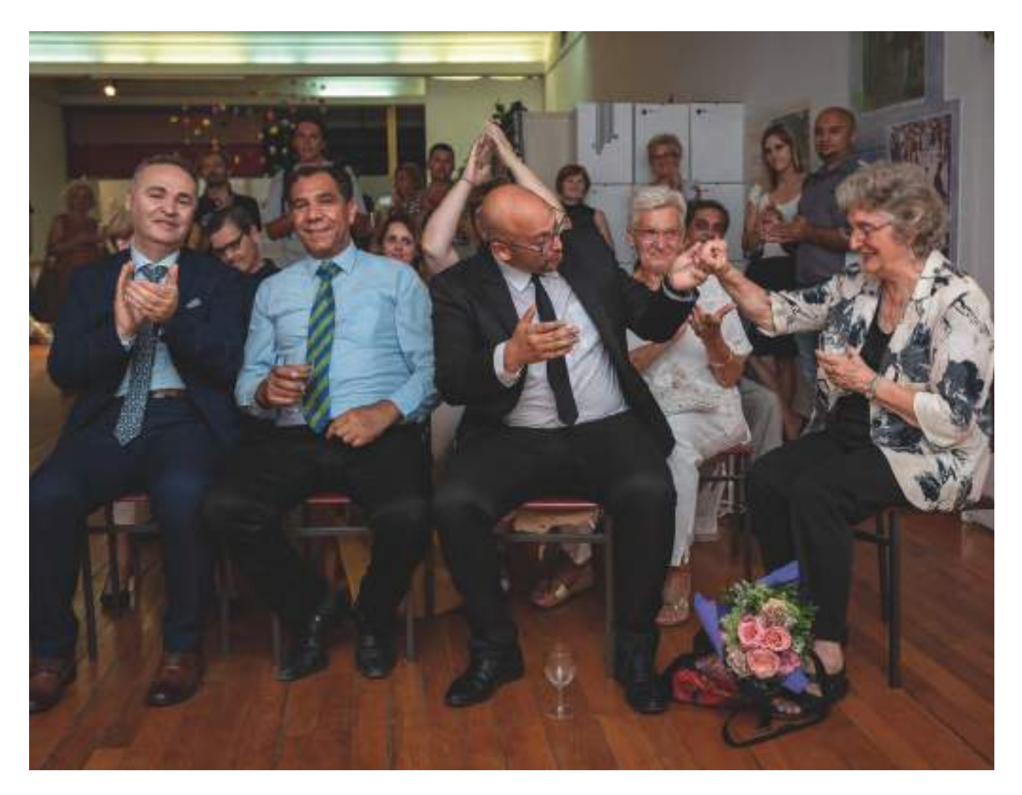
Authors of the exhibition from Macedonia, Croatia and USA