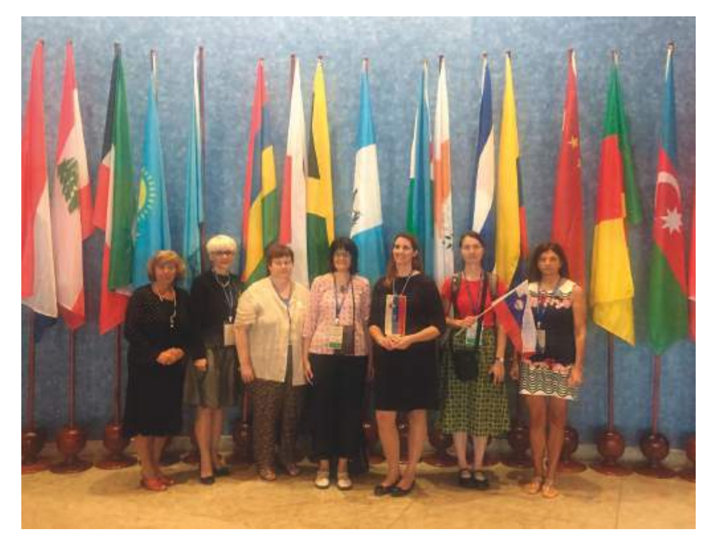
Slovenian delegation with the ICOM SEE Vice-Chair at the meeting in Mauritius

protecting ICH in Europe ICOM SEE countries had new inscriptions on the Lists. A joint inscription of dry stonewall building proofs how shared traditions among different countries can unite heritage experts in ICH protection. Interesting discussions and presentations were also part of the meeting - the roles of NGOs, reflect on how to follow up on issues related to elements already inscribed, particularly ICH in urban area. New topics, issues, adopted from ICH session in Mauritius will be included in initiatives ICOM SEE has in this field and successful inscriptions will back up the Special project application.