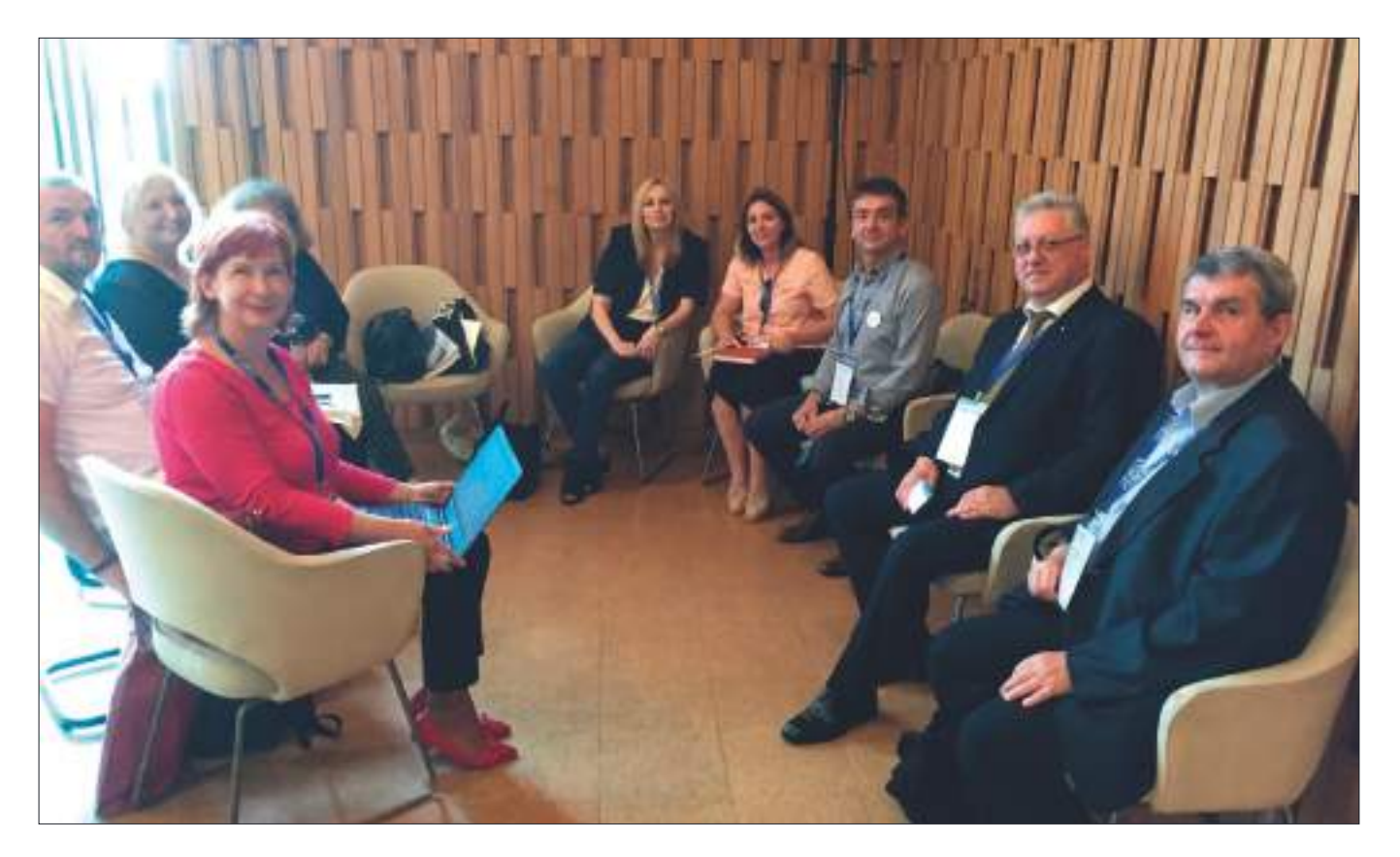
Board meeting in Paris during the Advisory, June 2018