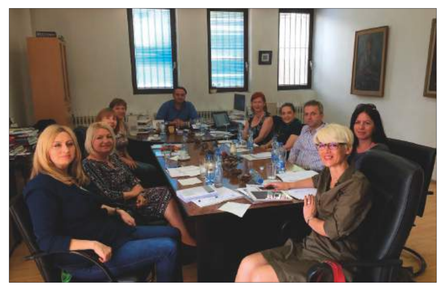
Board meeting in the Museum of Macedonia in Skopje, May 2018