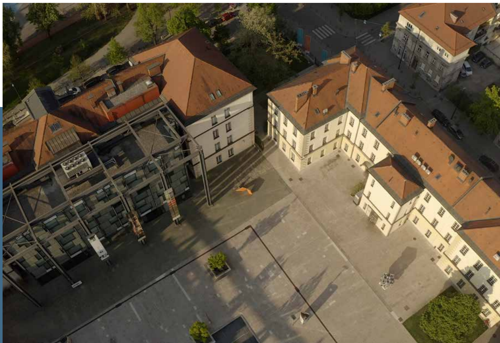
Slovene Ethnographic Museum, an aerial view during coronavirus lockdown, April 2020

The aim of the project is to collect data on what museums have done and are doing (first year) and to have a forum for exchanging experiences and views (second year). The general approach is that migration has always been a basic human condition. With this data in hand, graphic layouts for an exhibition and a brochure will be prepared. Both will be available for consulting and downloading on the project partners' websites and other social media. Print-on-demand versions will also be possible and if museums will want to have the exhibition and/or the brochure on their premises, this will also be possible. In the second year, during the first half of 2021, an International Forum in Lisbon will be organised as part of the Portuguese presidency of the European Union.